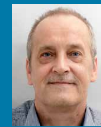
Heinrich Zlabinger Elektronik-Labor